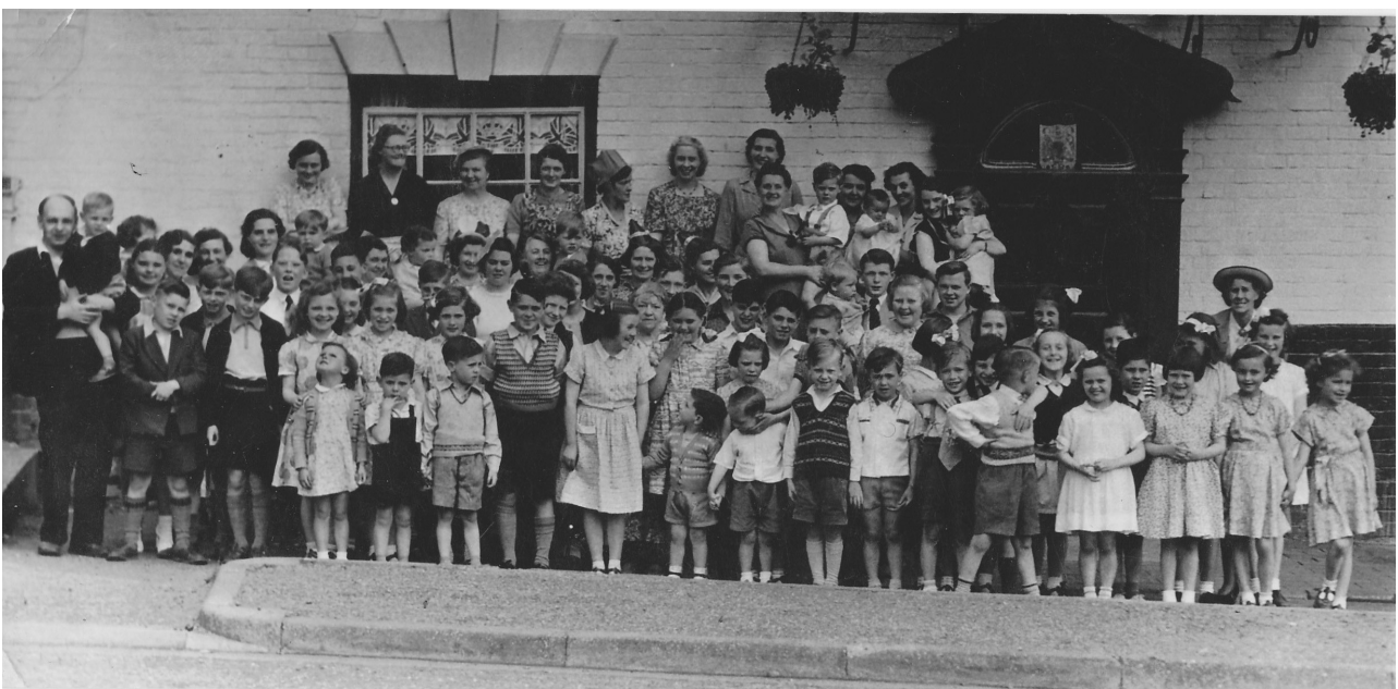
Coronation Day, outside "The Bell Hotel" in Mart Lane