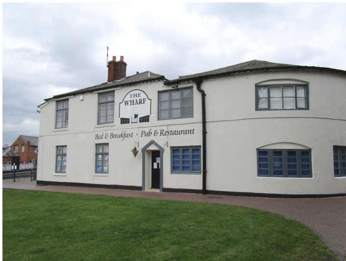
The Wharf, Bed & Breakfast and Restaurant 2019 Civic Award Winner

The Panel considered the sympathetic conversion and reuse of this historic building to be worthy of the 2019 Civic Award.