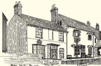
The Holly Bush