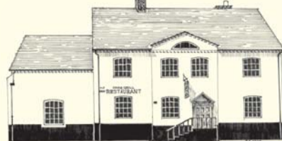
THE STEPS HOUSE (ex Red Lion)

During the 1930s, Stourport Swifts, who played their home games nearby, where Parsons Chain is located, used The Red Lion for changing rooms. In 1979/80 the pub was renamed Steps House.