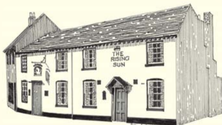
The Rising Sun