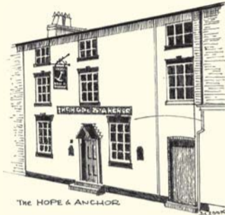
The Hope & Anchor