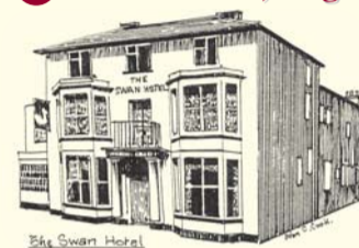
The Swan Hotel

The Swan, built by Richard Hornblower, stands at the junction of Long Lane (Lickhill Road) and Bunces Lane (Lombard Street), it was built following the erection of Stourport Bridge in 1775 and the subsequent growth in importance of the route up from the Bridge along Bridge Street. It became the headquarters of the local Whig Party in the first half of the 19th century. Soon it gained a reputation that put it on an equal footing with The Stourport Inn (The Tontine). The balcony above the front door, complete with carved swan to the front of it, was the ideal place from where election results might be read to the crowds below. It became the main Coaching Inn for the town. Slaters Directory in 1850 described the inn as 'a capital commercial building and Posting Inn, well known for its comforts'. There is a large lintel visible in the outer wall on Lickhill Road which was probably a gateway, large enough for horses and carriages.